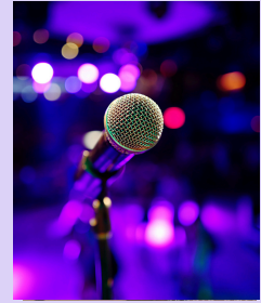
Keynote Speaker, Coming Soon